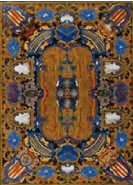
6. Piano di tavolo del Cardinale Grimani, inizi del XVII secolo