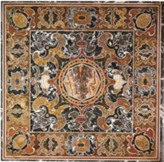
4. Piano di tavolo, post 1565, Madrid, Museo del Prado