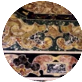
5. Piano di tavolo (part.), fine del XVI secolo, Racconigi, Castello