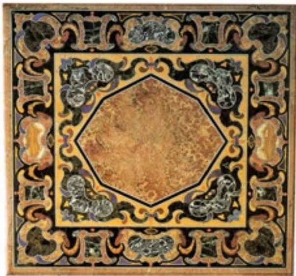
3. Piano di tavolo, fine del XVI secolo, Firenze Tesoro dei Granduchi