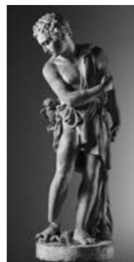
The Genius of the Hunt,

Museums with work by the artist include the Kunsthistorisches Museum in Vienna, the Hermitage in St. Petersburg, the Fitzwilliam Museum in Cambridge, the Galleria d'Arte Moderna in Milan, the Palazzo Reale in Turin, the Palazzo Nuovo in Bergamo, the Pinacoteca Ambrosiana in Milan and the Pinacoteca di Brera in Milan.