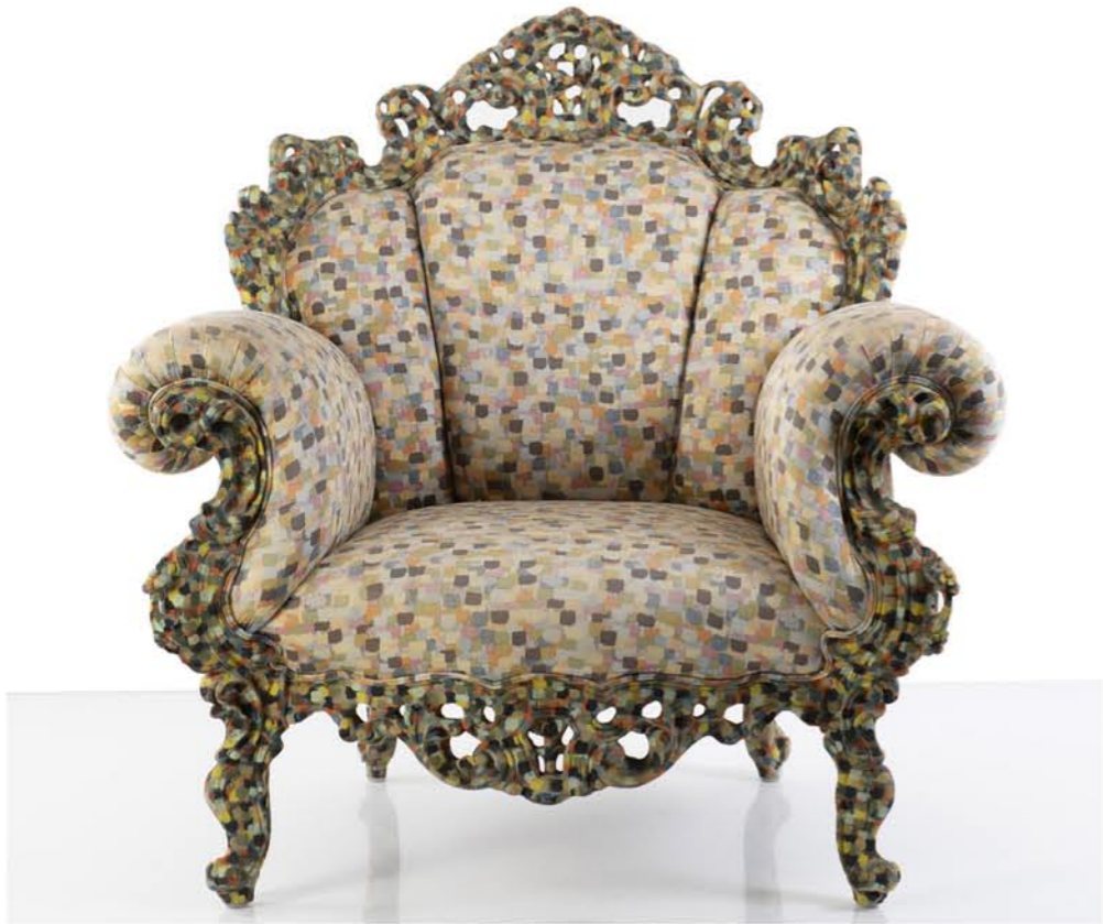
ALESSANDRO MENDINI Italy, 1931 - 2019